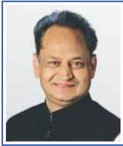
Ashok Gehlot Chief Minister

Invest Rajasthan 2022 is the manifestation of our commitment to building enduring partnerships with private enterprise for development of the state and prosperity of our people. It is an important milestone towards delivering on the commitments made by us to investors.