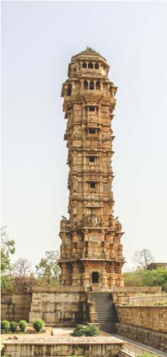
Image: Vijay Stambh, Chittorgarh