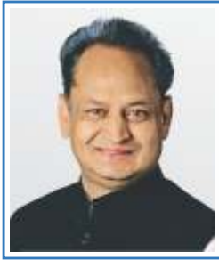
Ashok Gehlot Chief Minister

Invest Rajasthan 2022 is the manifestation of our commitment to building enduring partnerships with private enterprise for development of the state and prosperity of our people. It is an important milestone towards delivering on the commitments made by us to investors.